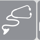
Mobile Physician Rounding