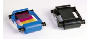
P200 series ribbon cartridges

P200 series dye sublimation color only ribbons also incorporate the new high color formulation and RFID technology.