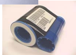
i Series Ribbons

All TrueColours® ribbons create brilliantly clear and vivid images that are smudge and scratch resistant. TrueColours® ribbons offer enhanced print character durability, and the 24-bit color and gray scale images show exceptional clarity in all images. The ribbons are designed with a unique silicone based "back-coating" which allows the ribbon to pass smoothly over the printhead and helps to extend printhead life. Each roll incorporates an easy load, patented design, grooved ribbon supply core and take-up core. This patented grooved ribbon core design helps eliminate any slippage at the ribbon take-up spindle, and a new core installs in only one direction for proper ribbon orientation