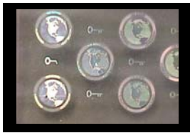
World Globe Image