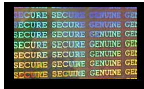
Genuine Secure Text Image

The chart below summarizes Zebra printing and laminating ribbons standard features, function, and competitive benefits: